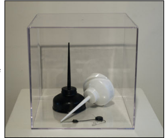
Cynthia Rettig - #2 from the oil can series

There is another three dimensional piece, this one submitted by Cynthia Rettig, my new studio-mate, that leaves me pondering the artists meaning and wanting to know more. Simply titled "#2 From the oil can series" a crystal clear display box containing two oil cans, one white and one black, the white can spilling out a black gooey substance that echoes the blackness of the other can. Such simple containers of color that hold a multitude of meanings.